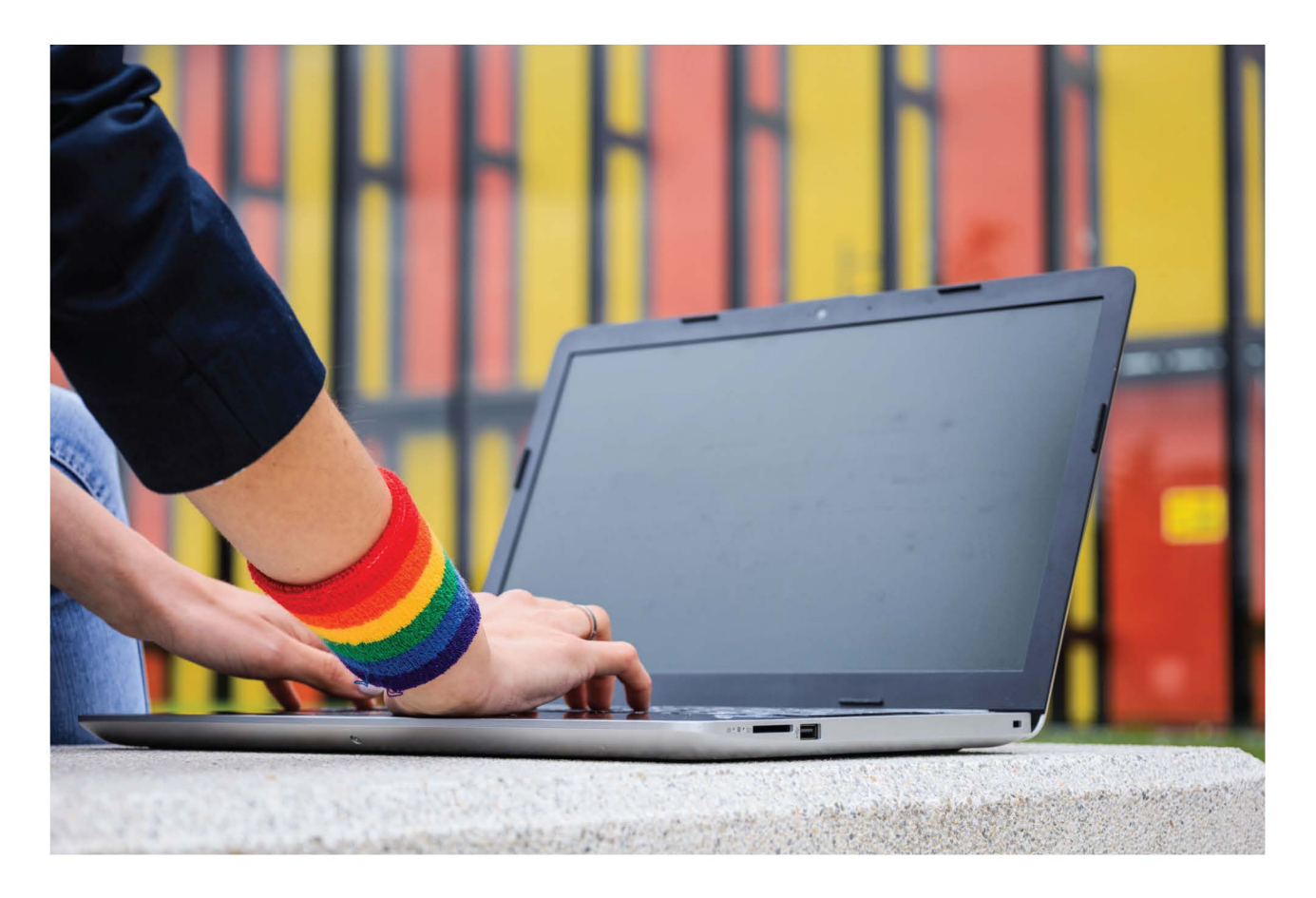
Rainbow Alliance and Inclusion Network — Annual Report 2023

• Developing companion training for Transitioning in the Workplace Guide.